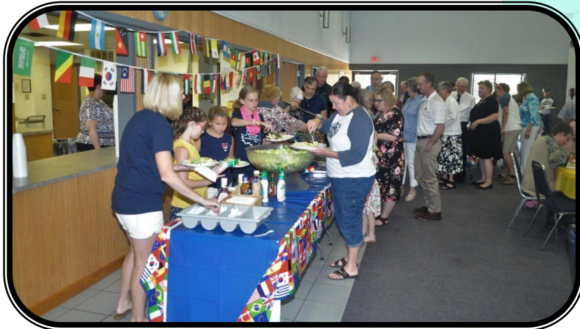
The youth and adults shared about their experiences serving in Nashville, Tn. and in Alvin, Tx.