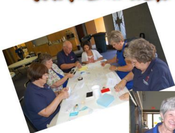
Making cards for teachers