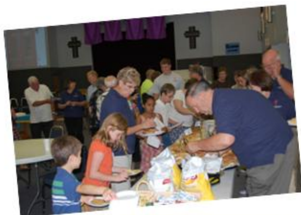
Sharing a meal & some kindness