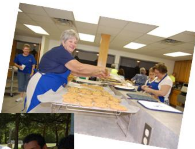
Cookies for our community leaders