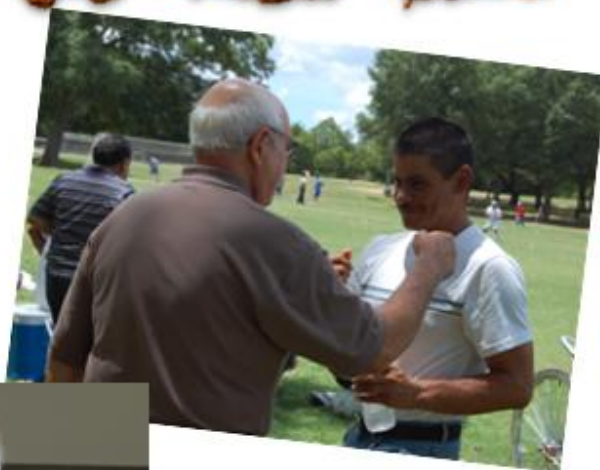
Sharing a smile & a water