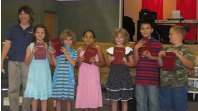
Third Graders Get Their Bibles