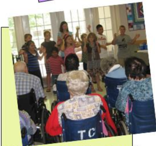
Singing for the Nursing Home